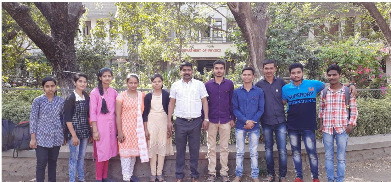
Study Tour to Savitribai Phule Pune University on the occasion of National Science day on 28 th February 2019.